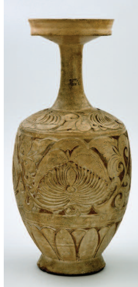
NORTHERN SUNG DYNASTY (CHINA) VASE WITH CARVED PEONY SCROLLS c. 980-1020, STONWARE WITH SLIP AND CLEAR GLAZE, 17 IN. HIGH INDIANAPOLIS MUSEUM OF ART, 47.153 GIFT OF MR. AND MRS. ELI LILLY

primitive in nature and include the three regions mentioned earlier — the pleasure center ( nucleus accumbens ), cost sensor ( anterior insula ), and fear axis ( amygdala ). If desire from the pleasure center has no offsetting influences, the executive brain will act on it and a purchase will be made. If price is an issue that counterbalances desire, it can sway the executive brain away from buying. Fear does the same.