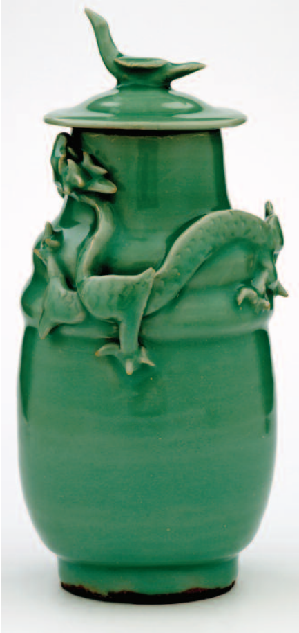
SOUTHERN SUNG DYNASTY (CHINA) FUNERARY URN WITH DRAGON AND COVER c. 1200-1299, CERAMIC WITH GREEN GLAZE, 9 3/4 IN. HIGH INDIANAPOLIS MUSEUM OF ART, 47.141 GIFT OF MR. AND MRS. ELI LILLY

Every decision to buy requires a balancing act. It involves the executive brain, located on its frontal surface, and also raw emotion emanating from areas deep within the brain. The latter are considered