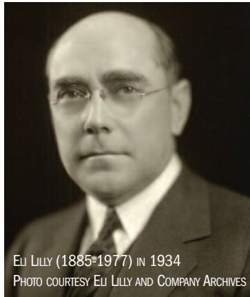
ELI LILLY (1885-1977) IN 1934

One of the most exciting new areas of study in collecting is the science behind buying decisions, a discipline known as neuroeconomics. In the January-February 2010 issue of Fine Art Connoisseur , I wrote about this field in an article titled “Why Collectors Collect.” The present article carries the concept further by exploring specific emotions evoked in a prominent mid-20th-century collector as he made buying decisions. By considering his choices in light of present-day knowledge, we can more easily envision how the same principles might apply to ourselves. Indeed, as both a collector and a physician, I myself have tried to understand and investigate my own divergent feelings and questions.